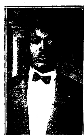
Recently elected First Asst. President-General of Universal Negro Improvement Association of the World. "Congratulations are in

Speaker and His Supporters Speak Lavishly on the Issue