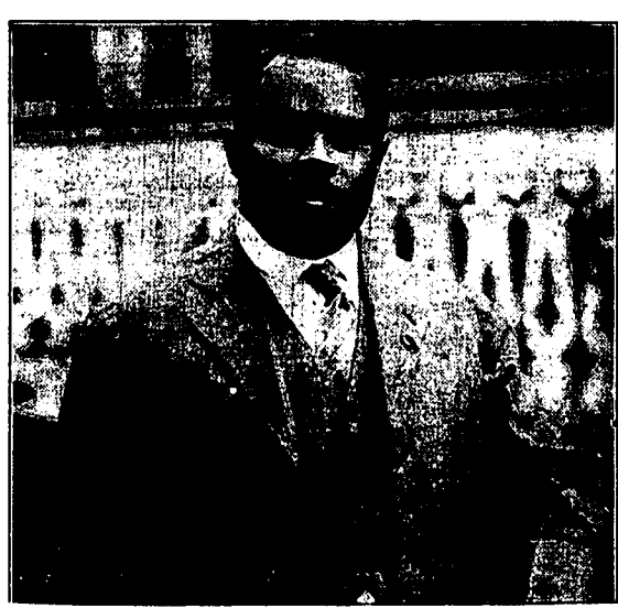
The Chieftain As He Is Today

The Spirit Still Exists—Not The Disposition of Organization To Allow Anyone To Suffer Say Delegates At Sixth International Convention—The Past Must Be Retrieved