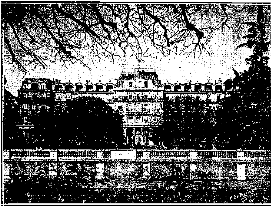
League of Nations Headquarters at Geneva, Switzerland, Where Marcus Garvey Presented Petition on Behalf of the Negro Race.

Until I arrived, the Negro was not represented as a majority group. It seems to me that every race in the world aspires after something through the proper channels with the exception of the Negro. Up to now the Negro seems to take the major questions of life lightly and deals with them more emotionally and sentimentally than practically. While these peoples and nations are here endeavoring to adjust their affairs by politics and legislation, the Negro seems to think that he can live permanently in a highly strung political world by sentimental appeals. We must change this attitude. We have to be practical, and that is why I have pleasure in representing the Universal Negro