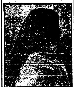
HOR-TON-A Hair Grower Gr

HOR-TON-A HAIR GROWER AND FACE PREPARATIONS